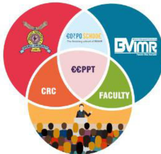
ORPOSCHOOL SYNERGY /SYSTEM/CHART

“The 7-S model is a good framework to help you ask the right questions, but it won't give you all the answers. For that, you'll need to bring together the right people with the right knowledge, skills and experience”. McKinsey & Co. www.mckinsey.com & Co. Checklist of Questions of CORPOSCHOOL for the McKinsey 7-S Framework: The following questions were taken as a starting point for exploring the situation in terms of the 7-S framework. (Adapted from McKinsey & Co. www.mckinsey.com & Co.). Strategy: What is our strategy? How do we intend to achieve our objectives? How are changes in customer demands dealt with? How is strategy adjusted for environmental issues? Structure: Hierarchical structure? Departments and communication among the team members for effective coordination? How do the team members organize and align themselves? Is decision-making centralized or decentralized considering the actions. Communication model, implicit or explicit? Systems: What are the main systems considering financial and HR systems, as well as communications tools and inventory of records. What are the dos and don'ts? Shared Values: What are culture, philosophy and core values? What is the culture of organization like? Style: What is the management/leadership style? Are the employees/team members competitive or creative?